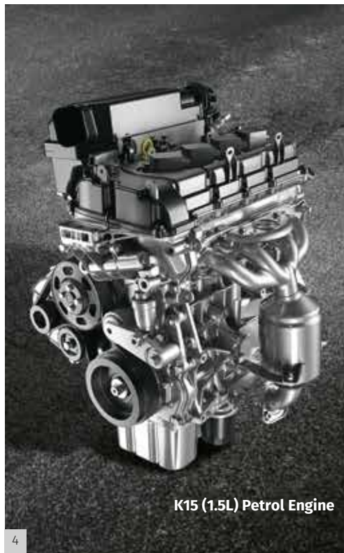
K15 (1.5L) Petrol Engine